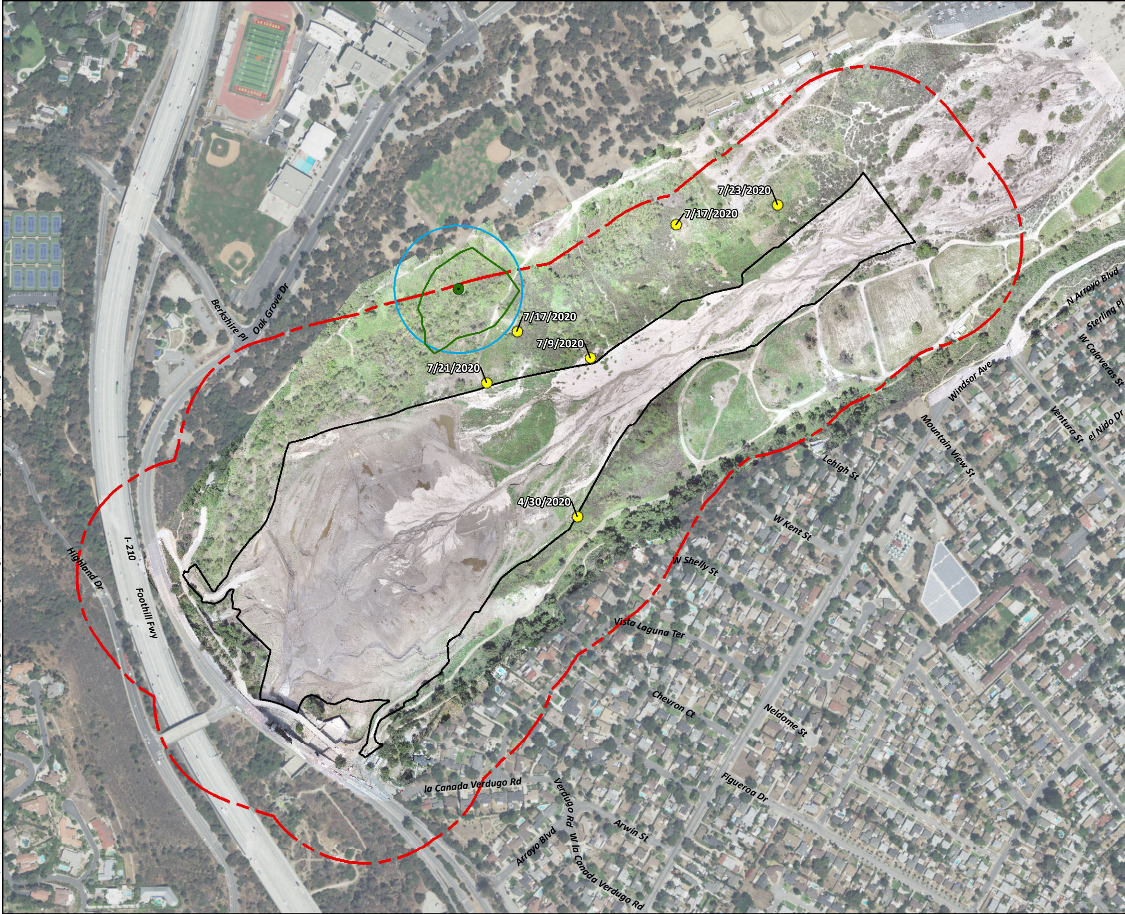
Figure 1. Least Bell's Vireo Monitoring July 20-24, 2020

Location: N:\2014\2014-003\008 Devils Gate Mitigation Plan\MAPS\os_and_mitigation_monitoring\monitoring\2020\DG_LBVI_monitoring_20200729.mxd (MAG)-Svager 7/29/2020